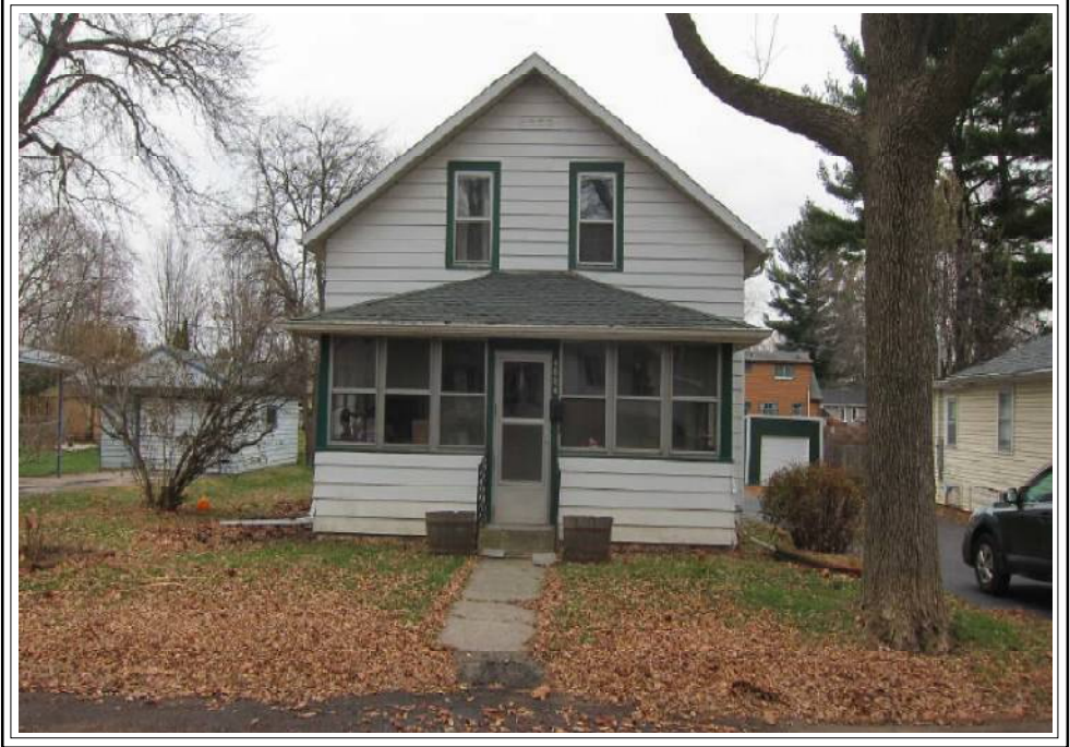
FRONT VIEW OF SUBJECT PROPERTY

Appraised Date: December 15, 2022 Appraised Value: $ 203,000