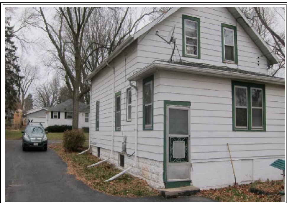
Rear of house