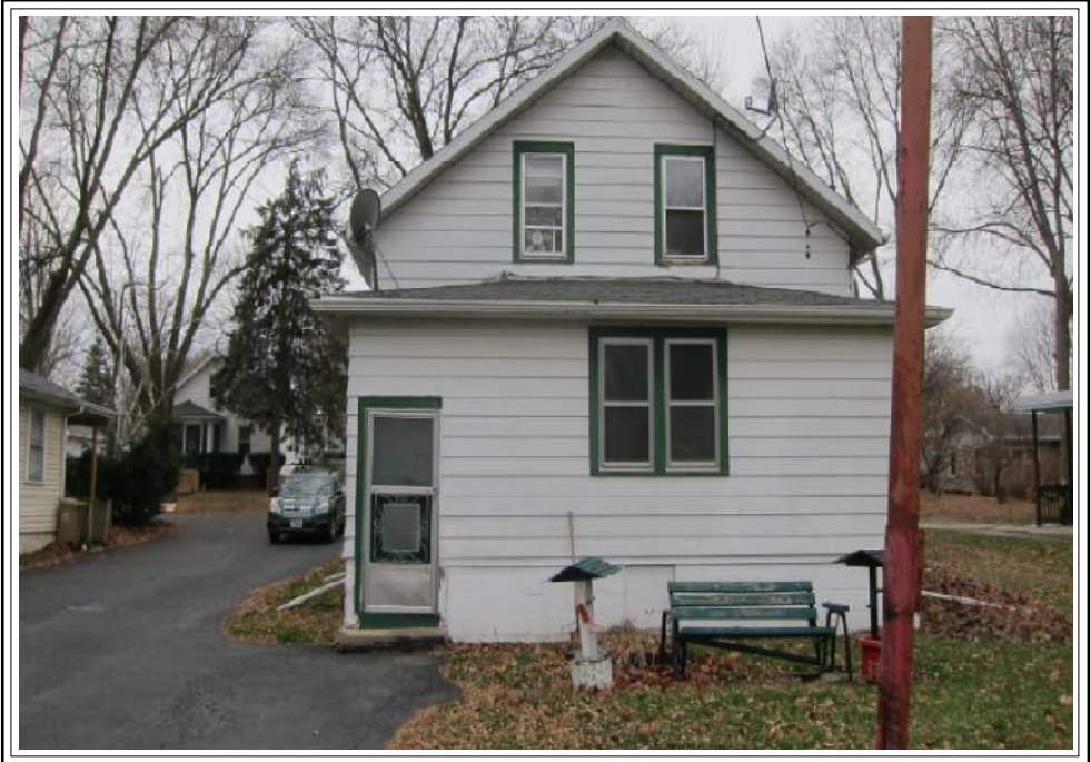
REAR VIEW OF SUBJECT PROPERTY

Appraised Date: December 15, 2022 Appraised Value: $ 203,000